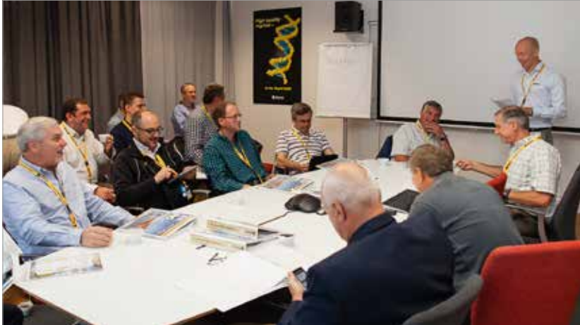
Group training with theoretical and practical training took place in Rapid Sweden. Partners from different parts of the world exchanged experience in granulation

The main target with the Golden Opportunity II – Avoid the traps – Contest was to widely educate partners and customers about the importance of the granulation as a part of the total production process.